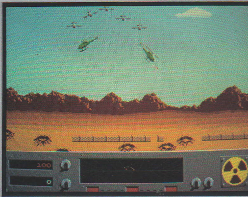
Aggressors swarm in over the mountains. Their mission: Take out your base!