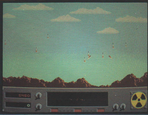
Incoming ICBM's. There's no place to hide!