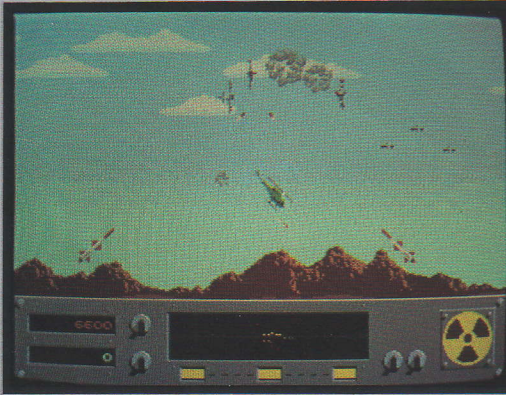
'Copter gun ship, fighters and bombers flame from the sky—victims of your lethal heat-seeking missiles.