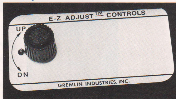
E-Z Adjust control panel

Anti-cheat programming Dual coin mechanism E-Z Adjust control panel Gremlin's Surround-A-Sound Easy-to-understand, complete maintenance manual provided with every game.