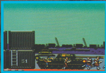
Attack the Enemy