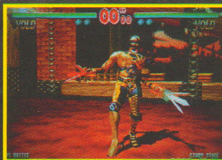
The character design is unrivaled.