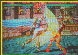
Combination moves are an integral feature

The character design of Soul Edge is unrivaled. Each fighter is beautifully rendered, shaded, and texture-mapped utilizing Namco's unsurpassed System II. Characters are brought to life with Namco's motion capture technology. The fighters look real, they breath, they scowl, they respond effortlessly to the players commands. The shiny steel weapons used throughout the game glisten, from dawn to dust to the bleakness of the night.