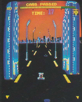
Turbo lapping racers at sunset.