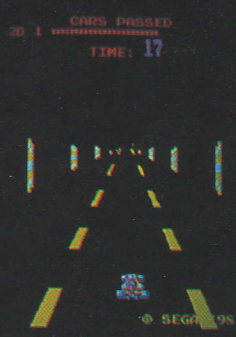
Tunnel vision raceway.