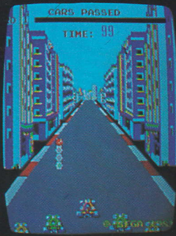
Racers off to a good start.